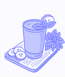
Most ordered beverage Buttermilk (Chaas)