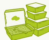
Largest bulk order 43 Veg Mini Thalís at Lucknow Jn.