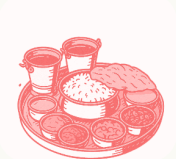
Most ordered dish Veg Maharaja Thali

20 lakh meals delivered across 200+ stations*