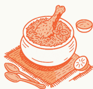
Patna ⇌ Delhi top pick Chicken Biryani