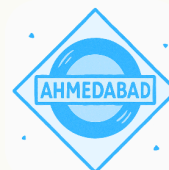
Most expensive order ₹9082 at Ahmedabad Jn.